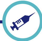
Type 1 Diabetes